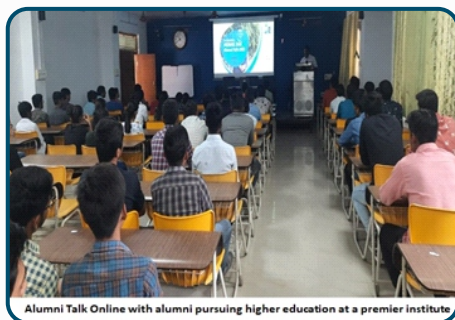
Alumni Talk Online with alumni pursuing higher education at a premier institute