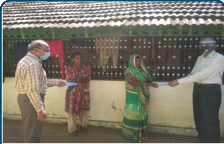
Masks Distribution and Awareness camp during First wave of COVID-19