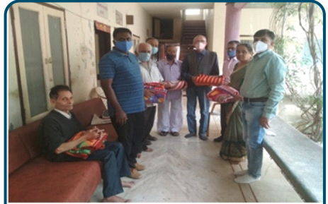
Masks Distribution and Awareness camp during First wave of COVID-19