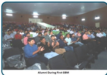
Alumni During First GBM

Alumni for students on CAET, AAU, Godhra campus