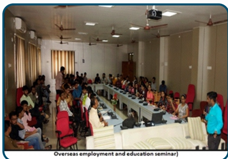
Overseas employment and education seminar