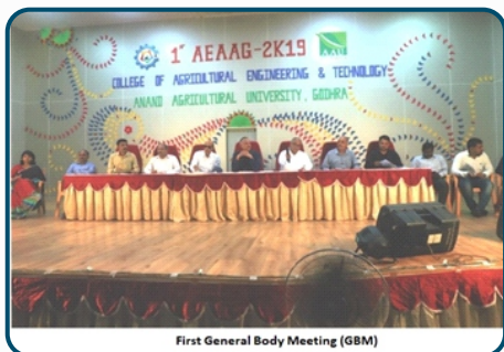
First General Body Meeting (GBM)

Alumni - a platform to the graduated students