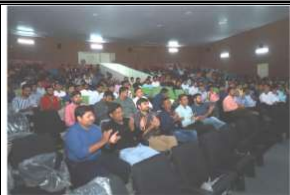
General Body Meeting