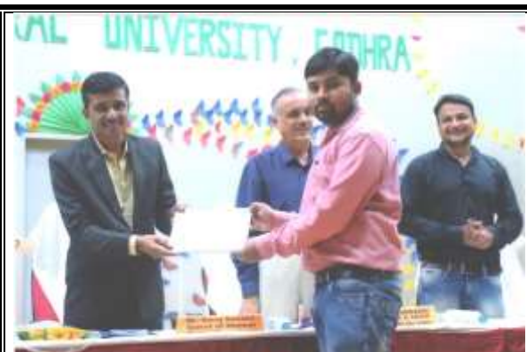
Felicitation of Alumni 2012 and 2013 batches